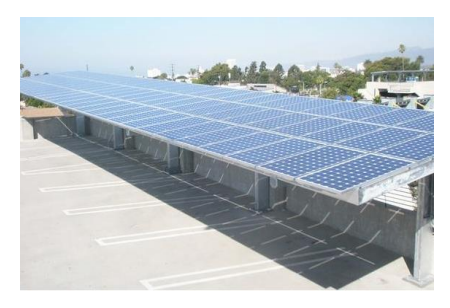
Figure 5. Santa Monica College carport.