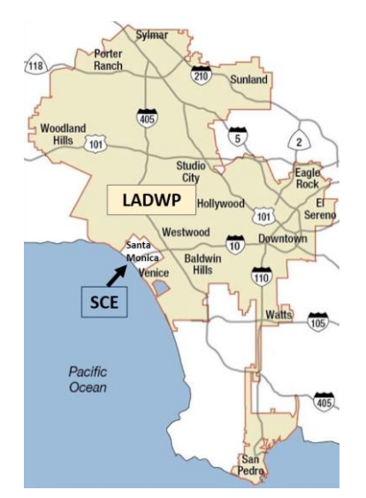
Figure 1. Image showing utility service territory.

The City of Santa Monica, a coastal community in Los Angeles County and home to more than 90,000 residents, is one example