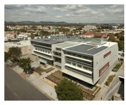
Figure 4. UCLA Health System rooftop solar.

The solar market in Santa Monica will continue to grow as city support and community engagement remains strong. California has seen increasing interest in community solar programs, including VNEM, and Californians continue to seek pathways to accessing renewable energy. The City of Santa Monica's Task Force on the Environment, established in 1991 by the city council, meets regularly each month to advise the council on environmental programs and policy issues. The city also is actively implementing their Electric Vehicle Action Plan to improve public charging infrastructure. Additionally, the city has established, and will continue to develop, energy reach codes to help buildings achieve energy efficiency targets and zero net energy goals that align with, or exceed, state goals and requirements.